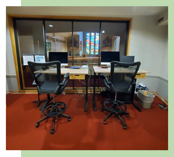
New A/V Room (Jan 2023)