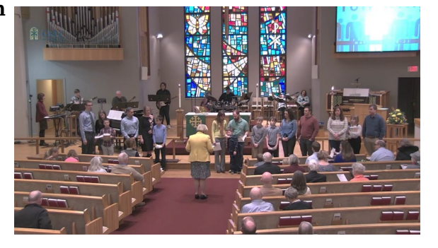
Holy Bible Faith Milestone (Jan 2023)