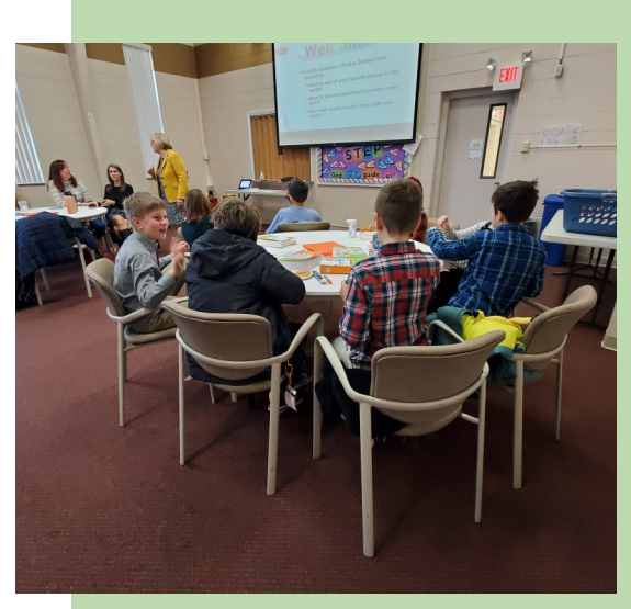
Bible Milestone for 4th Graders (Jan 2023)