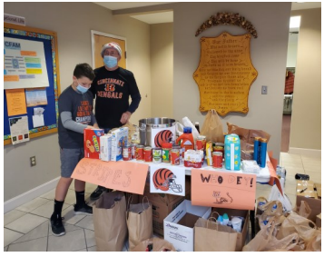
Souper Bowl of Caring (2022)